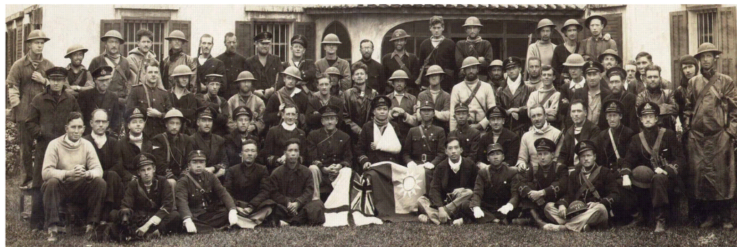
62 Members of the escape party with Chinese Officials at the American " Wai On hospital complex " run by the Seventh Day Adventists in Waichow on 30th December 1941:

The Mission of HERO is to honour the comradeship of our forefathers and foster strong new friendships among their descendants; hoping that this will forge strong ties between Britain and China for the 21st century and beyond. By creating a forum for sharing knowledge, we aim to raise interest in, and appreciation of, this unique episode in Sino-British history and to commemorate the 1941 escape with a series of memorial stones at Aberdeen, Nanao and Huizhou.