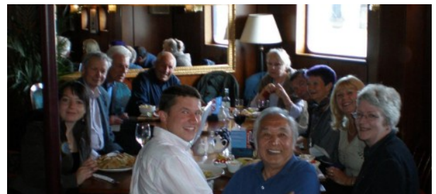
Saturday, June 18 · 2:00pm - 8:30pm